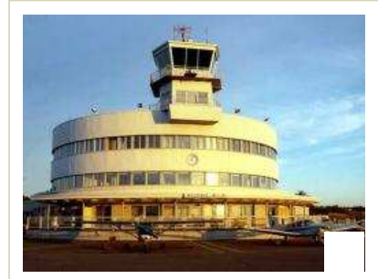
Main Building, 2002