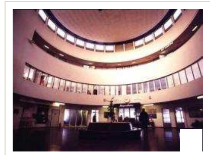
Main Interior, 2004

World Monuments Fund 350 Fifth Avenue Suite 2412 New York, NY 10118-2494 Tel: 646-424-9594 Email: wmf@wmf.org URL: www.wmf.org